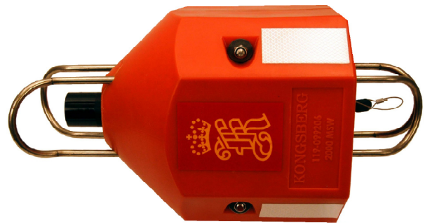
MST 319 w/floating collar

Type no..... 119-099206 Depth rating..... 2000 m Buoyancy: MST 319 / MST 324..... 4.5 kg / 4 kg Height with cage / diameter ..... 549 mm / 275 mm