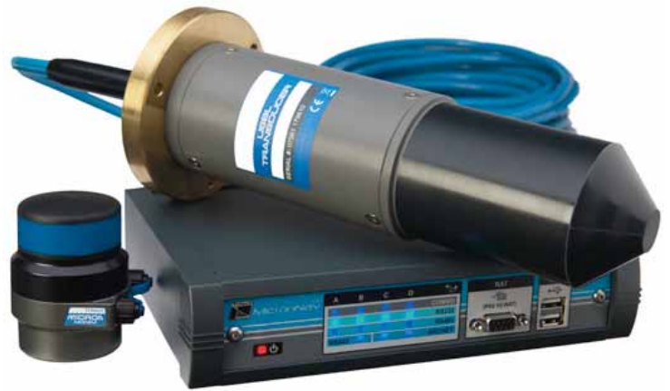
Picture of MicronNav100 Interface Unit, USBL Dunking Transducer and MicronNav subsea unit.

The MicronNav system is an innovative USBL positioning system designed for small vehicles. It has been primarily designed to be used in conjunction with the Tritech Micron/SeaSprite sonar and other Tritech Micro products. This concept will also be adapted and integrated into the Tritech SeaKing range of products in the future.